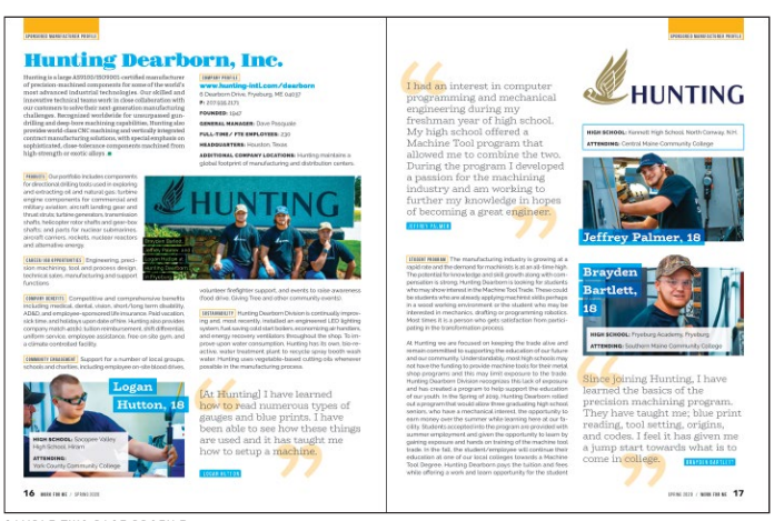
SAMPLE TWO PAGE PROFILE